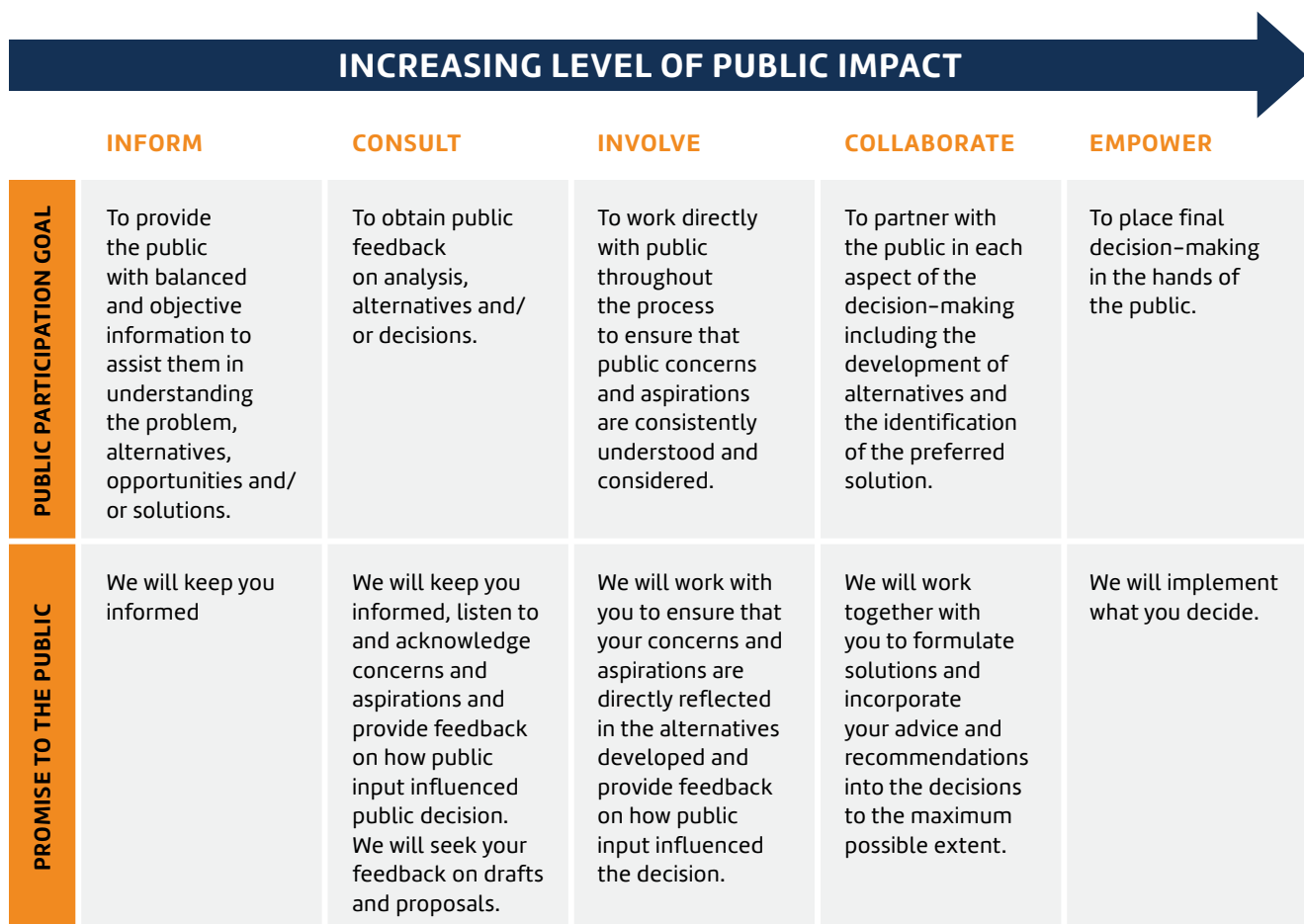
IAP2 Public Participation Spectrum

Think about your goal – this will help you to determine how you will deliver the engagement.