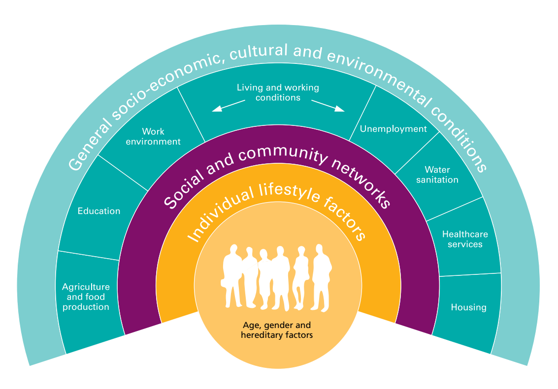
Diagram 1: A framework for determinants of health<sup>16</sup>