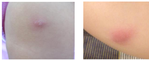
Few weeks after vaccination