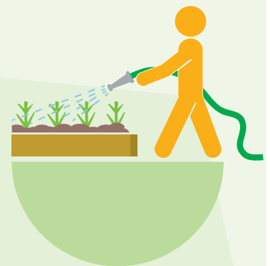
USE mains water