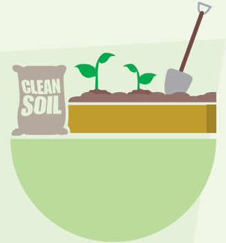
USE raised garden beds with CLEAN soil