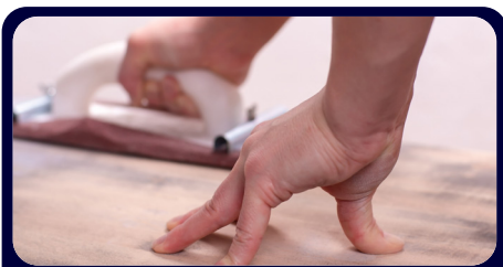
Renovating old homes and restoring old furniture