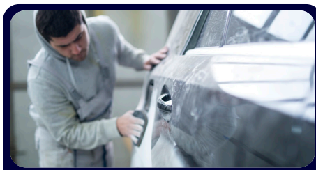
Restoring cars and boats