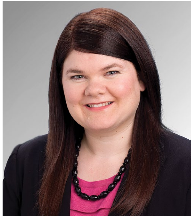
Hon. Zoe Bettison

There is much evidence in the coming pages of the progress we have already made towards achieving this aspiration – an aspiration that involves all South Australians.