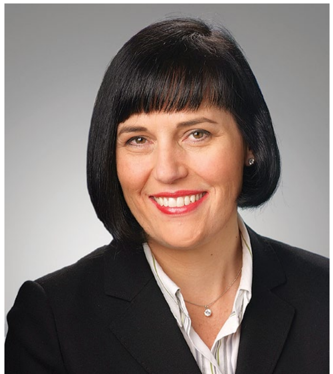
Hon. Leesa Vlahos

Minister for Communities and Social Inclusion