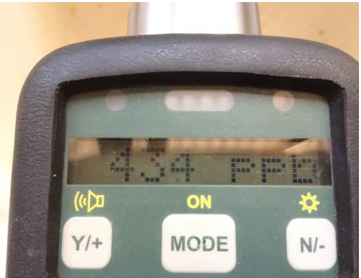
ppb = Parts Per Billion