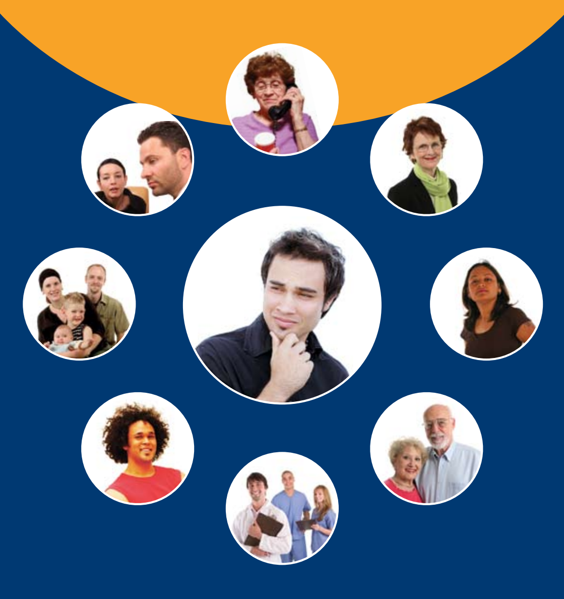
Privacy, Confidentiality and Getting the Best Care and Treatment