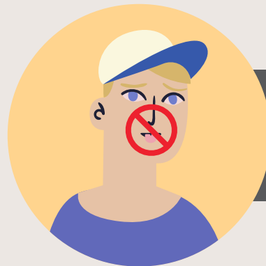
Thawtnak le rim theih lo