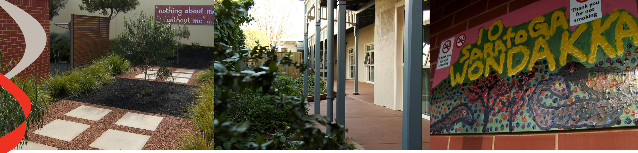
Trevor Parry Centre