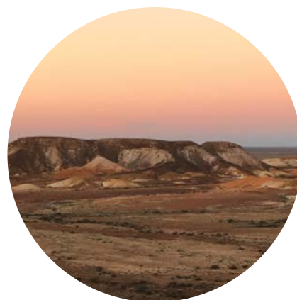
The Kanku-Breakaways Conservation Park forms part of the traditional country of the Antakirinja Matuntjara Yankunytjatjara people.

Recognising culture and language as determinants of Aboriginal health and wellbeing ensures that services are designed and delivered in culturally competent/appropriate ways that involves the inclusion of Aboriginal people. This recognition is essential in increasing opportunities for Aboriginal people to connect with Country.