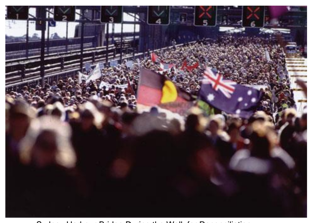
Sydney Harbour Bridge During the Walk for Reconciliation National Museum Australia, 2013, Symbols of Australia, viewed 24/10/2013, https://www.nma.gov.au/defining-moments/resources/walk-for-reconciliation