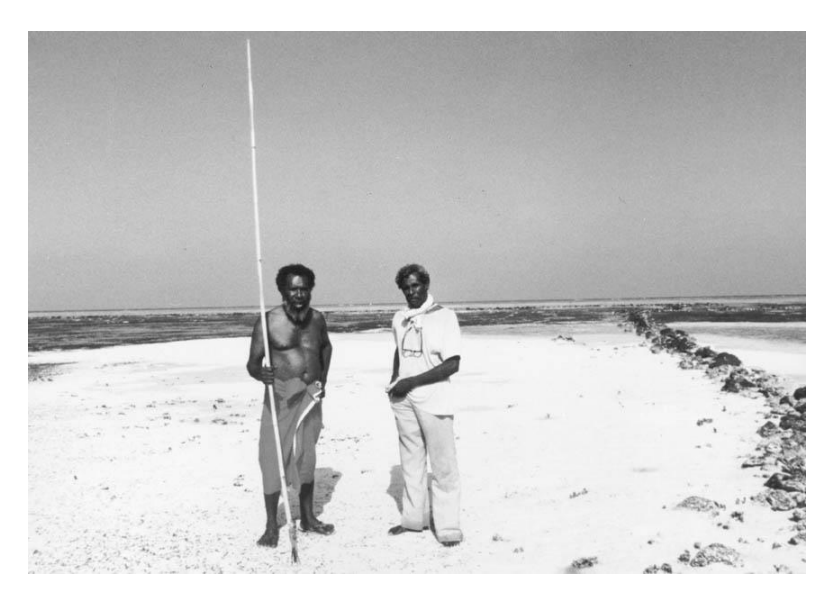
Eddie Mabo on the Island of Mer

Museum of Australian Democracy, 2012, Documenting a Democracy , viewed 28/9/12, < <a href="http://foundingdocs.gov.au/enlargement-eid-86-pid-33.html">http://foundingdocs.gov.au/enlargement-eid-86-pid-33.html</a>